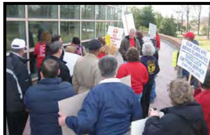
The management bargainers at the C&T table in Oakton, VA, got a taste of mobilization. More photos.

A bright green truck served as a rolling billboard at the rally with our messages of fairness and respect.