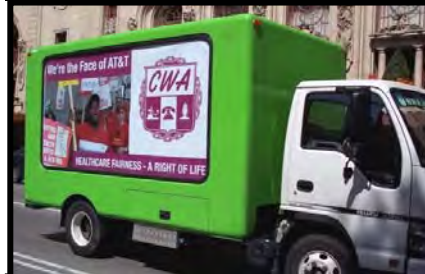
A rolling billboard outside AT&T's corporate HQ sent our message: “Healthcare Fairness - a Right of Life and “We’re the Face of AT&T”