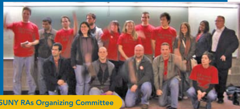
SUNY RAs Organizing Committee

The GOTV operation was critical, and many unions and allies helped during election day, including three people from the Long Island Progressive Coalition, six volunteers from the