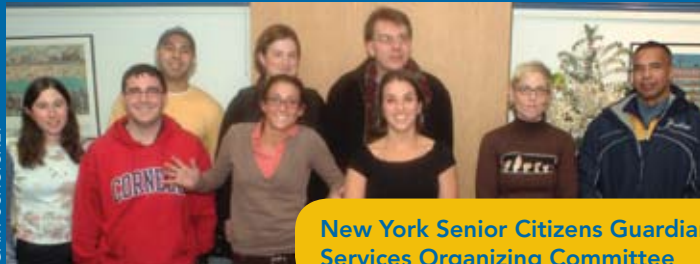
New York Senior Citizens Guardian Services Organizing Committee