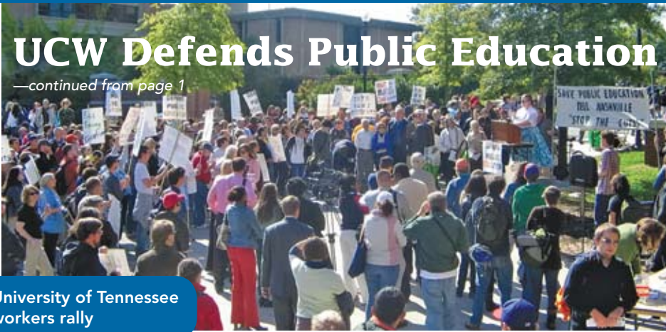
University of Tennessee workers rally

The UCW, joined by the Progressive Student Alliance, decided to hold the demonstration in the wake of drastic budget cuts that have left the University bleeding to the level of $38 million. With more cuts expected, union members and supporters gathered to make their voices heard.