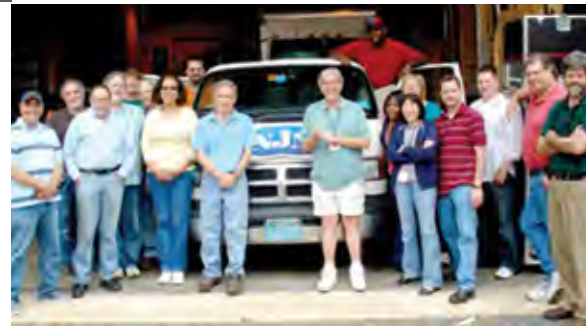
Some of the Local 1032 members working at NJN, at the network’s Trenton studios.

Gov. Chris Christie and New Jersey Network’s (NJN) interim director, had set a July 1 deadline to turn the publicly-owned system over to a non-profit corporation. Instead, Senate and Assembly committees created a commission that will report back by October 15.