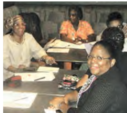
UTHSC members met to plan further efforts to save jobs.

The budget includes "an additional longevity payment" meant to provide a